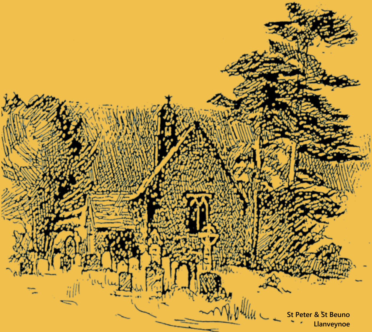
St Peter & St Beuno Llanveynoe

The Parishes of Clodock & Longtown with Craswall, Llanveynoe, St Margaret's, Michaelchurch Escley & Newton