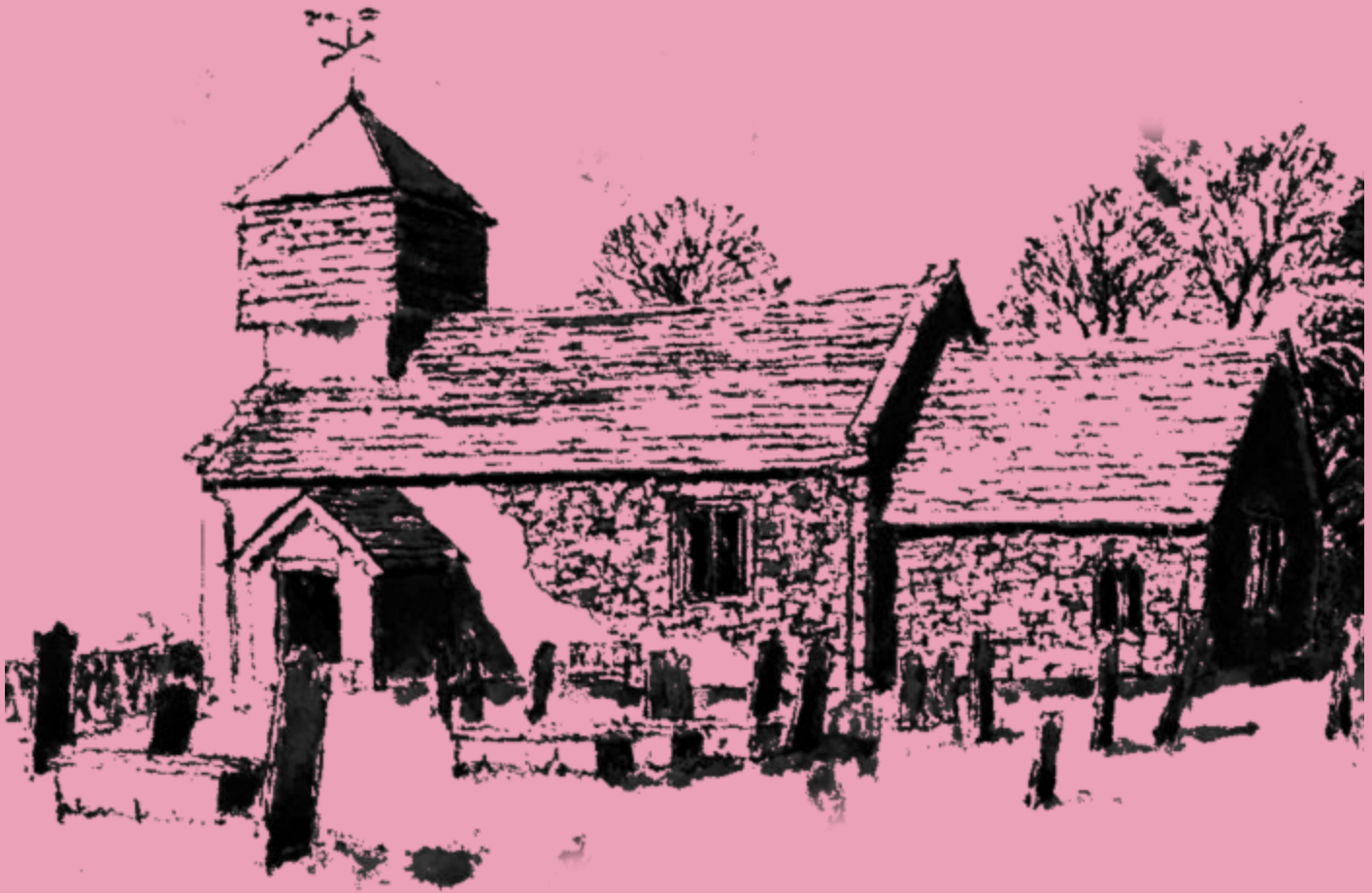
St Margaret's Church

The Parishes of Clodock & Longtown with Craswall, Llanveynoe, St Margaret's, Michaelchurch Escley & Newton