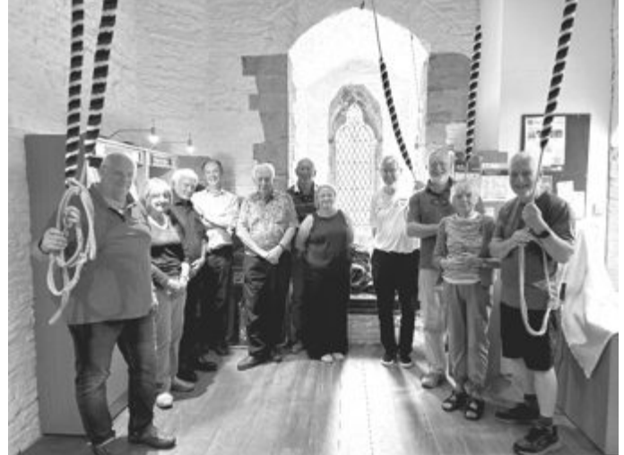
Peterchurch Bell Ringers (Left to right)

A happy and successful event was held on Saturday, July 5 th with ringers from many towers in the area represented and visitors watching the experts and sometimes having a go at ringing the bells themselves. Breakfasts were enjoyed beforehand and refreshments available throughout the afternoon. Several folk expressed an interest in attending practices and learning more.